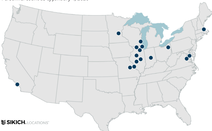
● SIKICH LOCATIONS*

2019 Revenue ..... $167.4M Total Partners ..... 100+ Total Personnel ..... 1,000+ Personnel count as of January 1, 2020