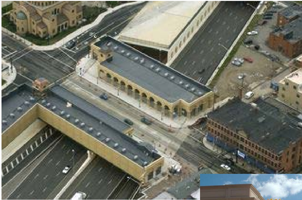
The Cap at Union Station - Columbus, OH