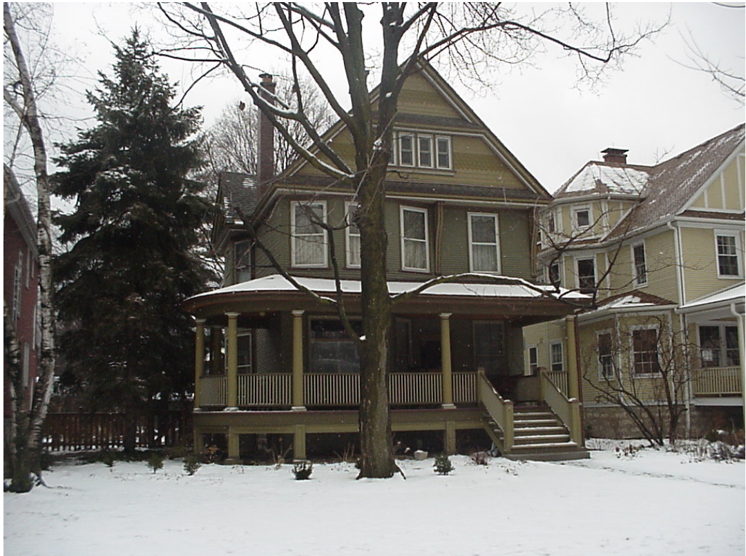
313 S. Elmwood Avenue (REHABILITATION) residence, 1890's