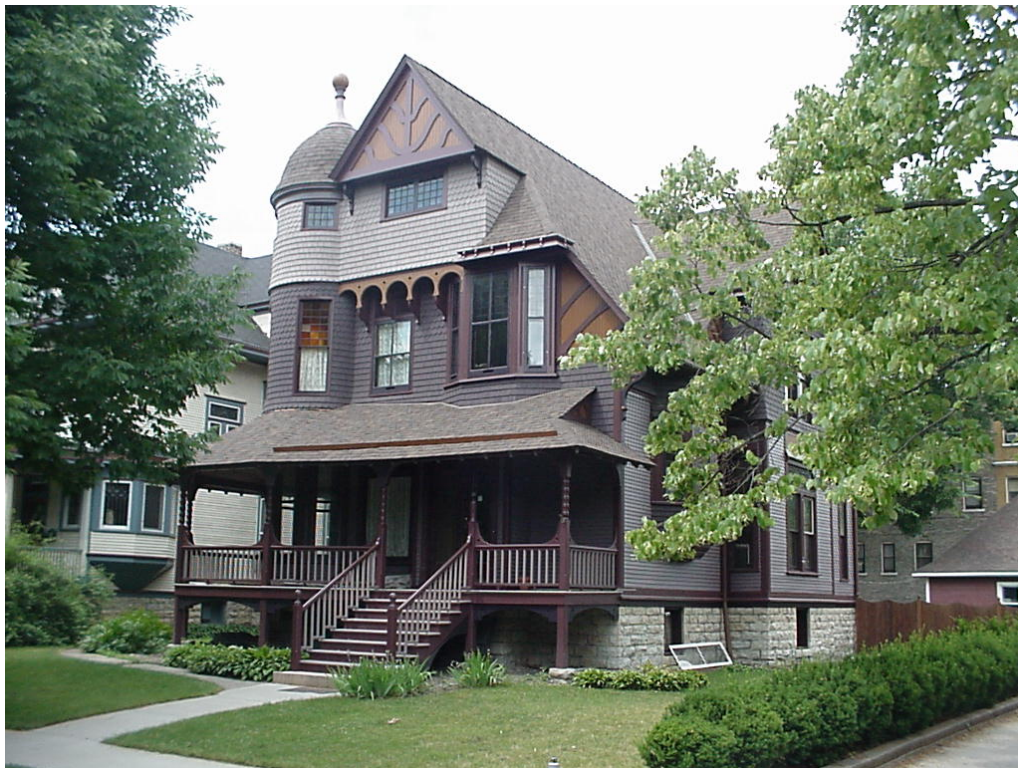
209 S. Grove Avenue (RESTORATION)