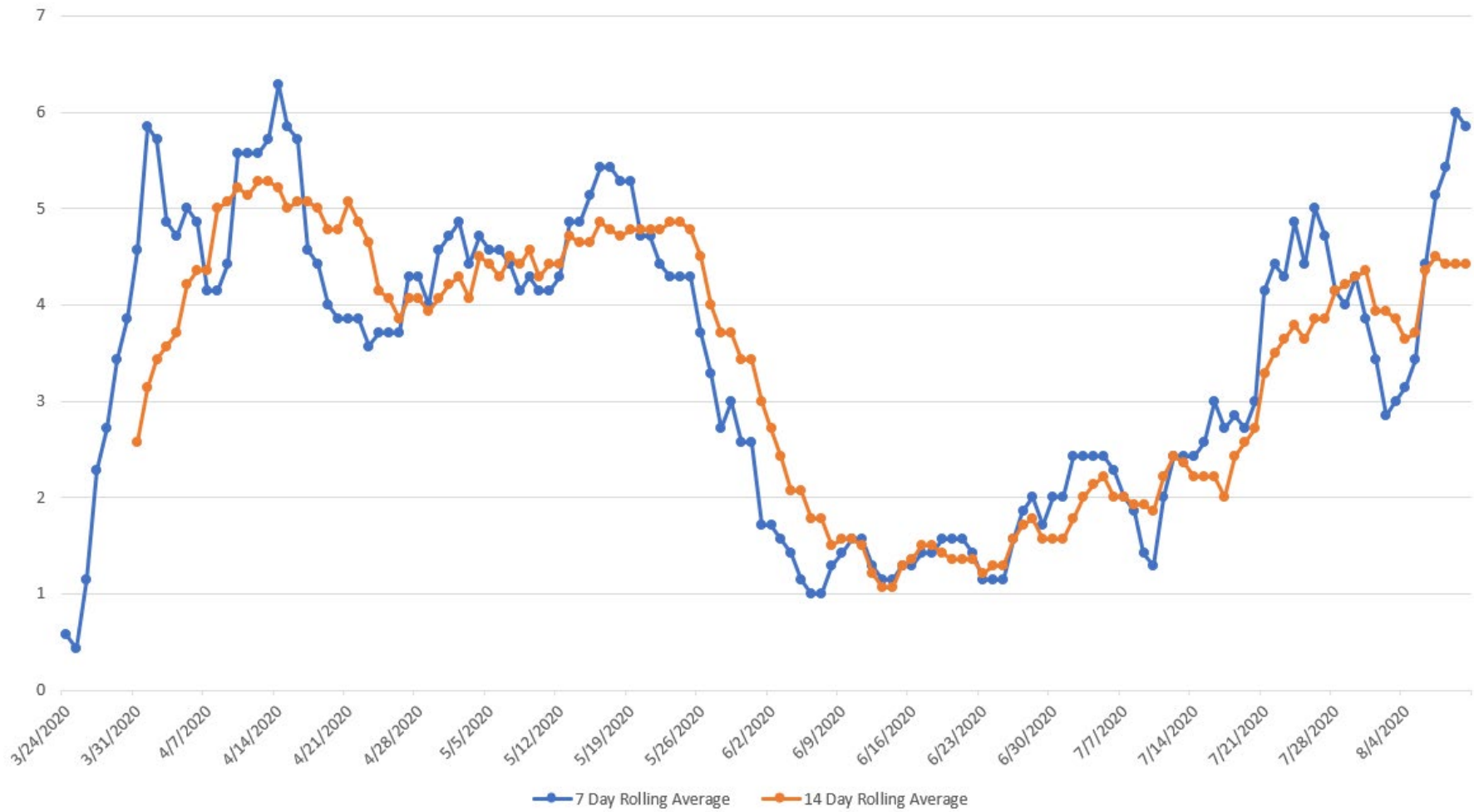
Oak Park Resident COVID-19 Cases-Rolling Averages

Oak Park: 7 & 14 Day Rolling Averages: 7 day is 5.9 and 14 day 4.4