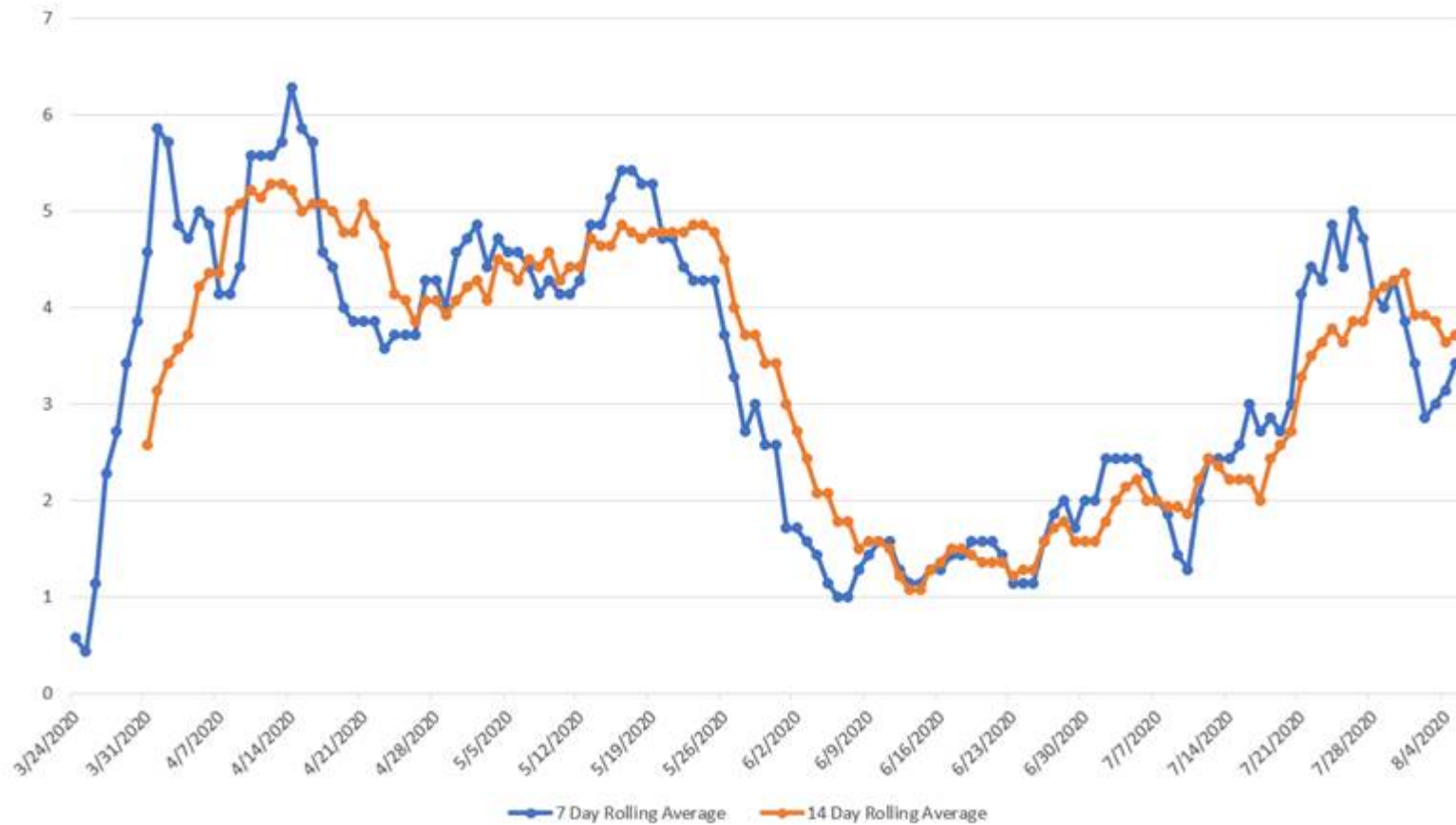
Oak Park Resident COVID-19 Cases-Rolling Averages

Oak Park: 7 & 14 Day Rolling Averages: 7 day is 3.43 and 14 day 3.71