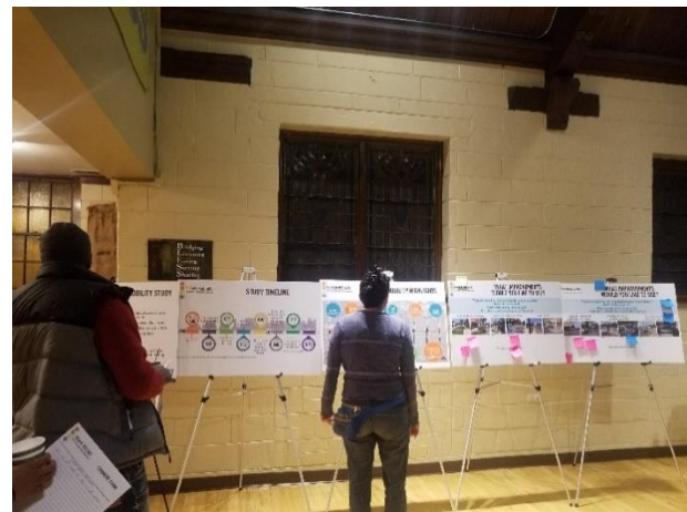
Stakeholders attend a public visioning at Redeemer Church.