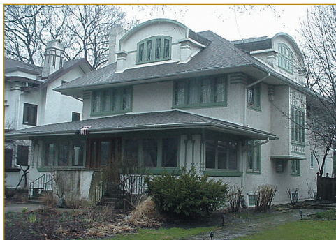
639 Fair Oaks

By 1920, as a building boom ensued, the various revival styles came into vogue, supplanting both the late-Victorian and Prairie styles. Colonial, Classical and Tudor Revivals were the most popular, used widely in typical singlefamily homes and larger estate homes, as well as apartments and commercial buildings. In 1902, as Oak Park severed its ties with Cicero Township and incorporated as a selfgoverning municipality, 10,000 people called the Village home. The population