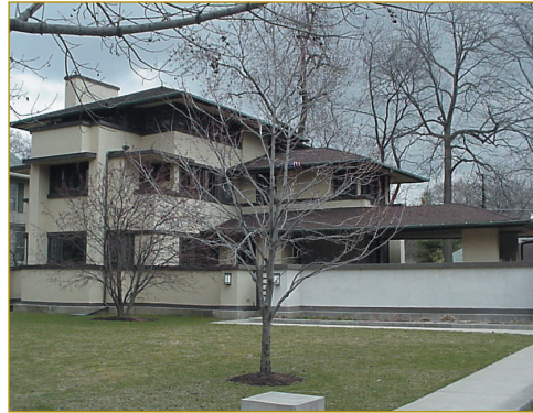
636 N. East

contribute to its historic character. The district is an excellent living museum of the past 150 years of architectural history in the United States.