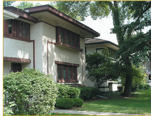
714 & 716 Columbian

continued to grow, doubling every ten years to nearly 60,000 people in 1930. Today, the district encompasses the architectural development throughout that period.