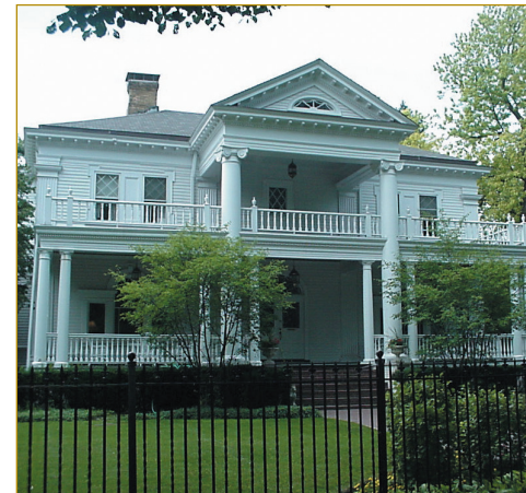
637 N. Euclid

Although still unincorporated and with only a few thousand residents, as early as 1872 Oak Park was becoming an elite suburb that had outlawed the sale of alcohol, spearheaded construction of a substantial brick schoolhouse, boasted