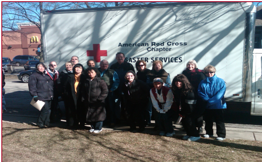
Oak Park Medical Reserve Corp

A noteworthy achievement in 2012 was the completion of the Village's Multi-Hazard Mitigation Plan, completed by Emergency Preparedness staff in collaboration with the Village's Sustainability Coordinator and Public Works staff. The Plan, one of the first to incorporate 'green' strategies to mitigate flooding, was reviewed and approved by both the Illinois Emergency Management Agency (IEMA) and the Federal Emergency Management Agency (FEMA).