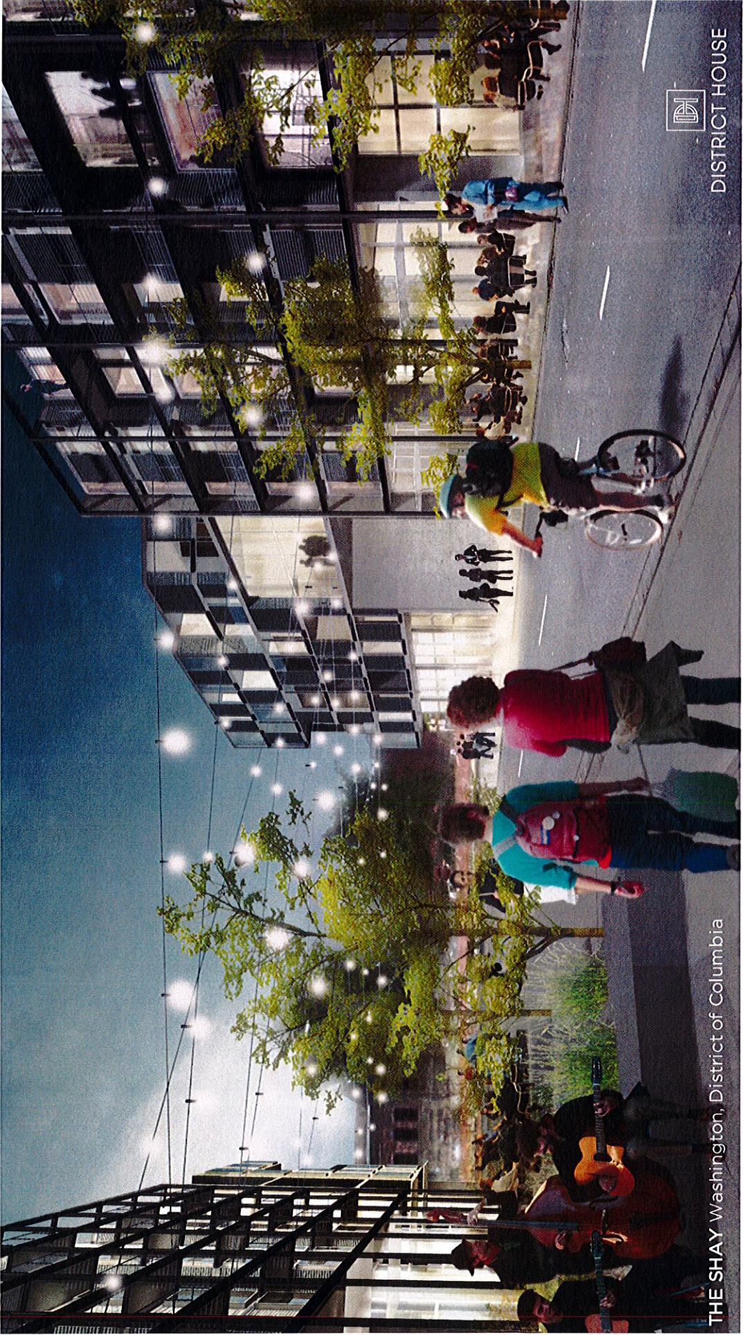
THE SHAY Washington, District of Columbia