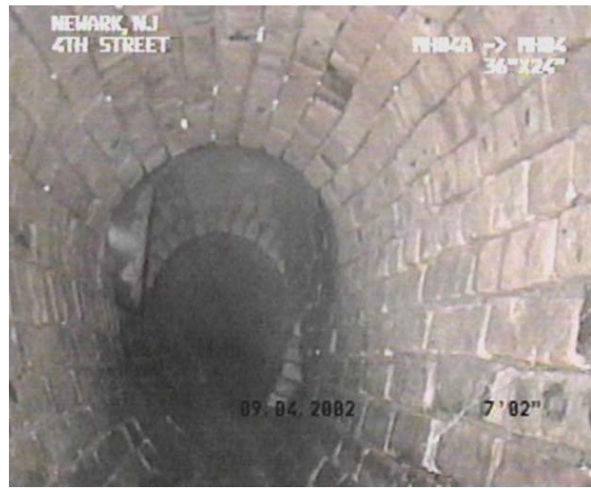
Figure 2. Example of Condition Grade 2 Brick Sewer- Minimal Potential for Short-Term Collapse; Further Deterioration Probable