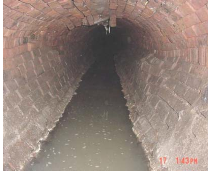
Figure 4. Example of Condition Grade 4 Brick Sewer - Sewer- Collapse Likely in Foreseeable Future