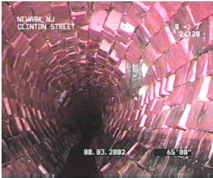
Figure 3. Example of Condition Grade 3 Brick Sewer Collapse Unlikely in Immediate Future; Further Deterioration Likely